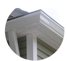
Bolt Gutter Protection

Should you find yourself experiencing defects with any of our products, please don't hesitate to reach out to us. Our committed team is ready to assist you to the best of our abilities.