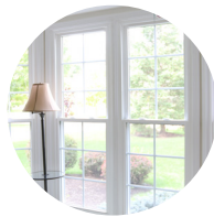
Windows/ Sliding Glass Doors

Universal Windows Direct is committed to ensuring longstanding warranty coverage on the following home improvement products: